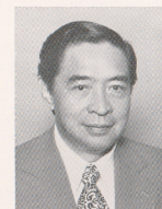
DR YEHOH GIM SENG (Yeoh Gim Seng) Speaker