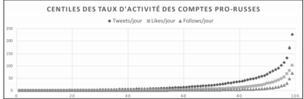
Translation : Pro-Russian accounts activity rates sorted by centiles (Tweets/day, Likes/day, follows/day)

To start, it is necessary to assert beyond what daily number of tweets, follows, or likes it is possible to determine that an account acts abnormally. To respond to this methodological question, we have divided our databases into percentiles. For example, in the case of our Twitter database of pro-Russian accounts, we have created a compartmentalization in percentiles according to the rate of tweets/day, favorites/day, follows/day (the average number of individuals to which the account subscribes every day) for each of the accounts in the database: