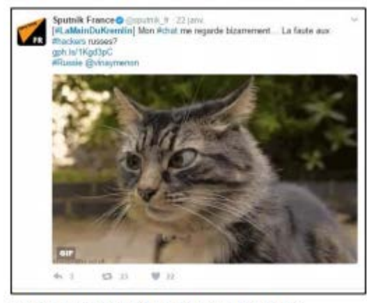
Figure 1 A typical Sputnik ironical tweet. Translation : #Kremlinshand My cat is staring at me weirdly ... Is it the Russian hackers fault ?

To develop this narrative, several methods are used: first, every piece of information that may discredit the United States, a country from the European Union or NATO, or at least present a negative aspect of one of them, will be turn into an article with the catchiest title possible, in order to cast doubt in the reader's mind. We can take as an example an article by Sputnik that reads that "chaos in Ukraine is American-made, such as in the Middle East."<sup>18</sup> Actually, this accusatory article is nothing more than the retranscription of an analysis from the Italian newspaper Primato, founded by the Minister of National Education of Fascist Italy, a detail not mentioned by the author at Sputnik. In other cases, a tactic of the news agency is to present Russia as a victim, thus trying to highlight a strategy of demonization orchestrated by Western media. Here, we can use the media counter-campaign launched by RT and Sputnik after the United States accused Russia of interfering in its presidential campaign. Meanwhile, both platforms took advantage of being in American and European media's visor to strengthen the idea of a diabolization of Russia. Hence, a multitude of articles were published that covered this idea, exaggerating it, and even satirizing the accusations of Western media. A hashtag<sup>19</sup> #LaMainDuKremlin [#KremlinsHand] was even propagated in February 2017 (cf. figure 1).